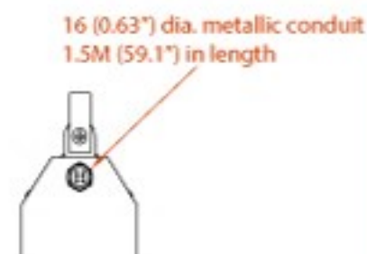
End view - conduit exit side