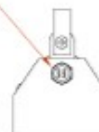
End view - conduit exit side

16mm (0.63") dia. metallic conduit 1.5M (59.10") in length