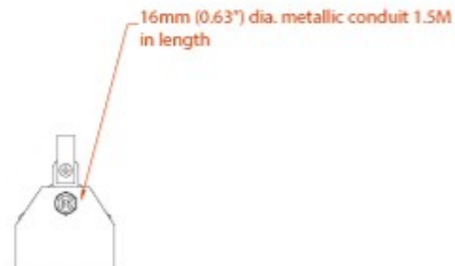
End view - conduit exit side