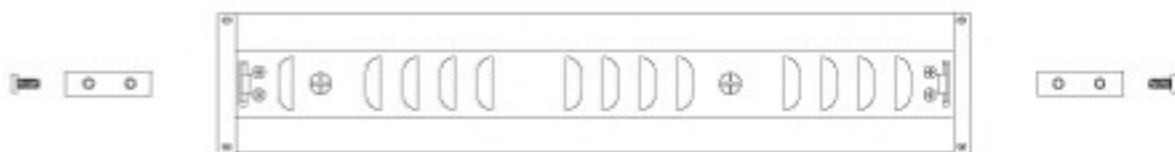
Rear view with mounting brackets disassembled